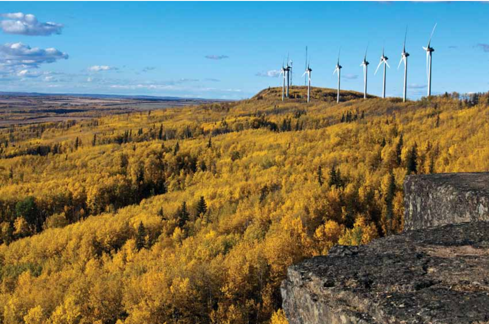
Bear Mountain Wind Park, Dawson Creek, BC

While current permitting processes help ensure the low-impact development of wind projects, they can also be needlessly complex and uncertain. There is often significant duplication and overlap between processes, and requirements and timelines are often unclear. These problems are compounded by a lack of dedicated government resources: there simply aren't enough people working on approvals and permits to handle the interest in new wind energy development in BC. CanWEA calls on the provincial government to ensure that efficient and effective review, permitting and approval of new wind power and renewable energy projects is a priority at all levels.