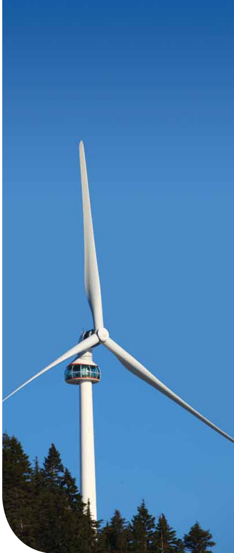
Eye of the Wind Turbine, Vancouver, BC

Installing wind doesn't just diversify BC's hydro system – it almost perfectly complements it. Demand for electricity in BC peaks during the winter, when there is strong heating and lighting load, and tapers off in the spring and summer 43 . BC gets its strongest winds in the winter months, peaking in the freezing months of December and January, just when streamflows are at their lowest. Conversely, winds blow least powerfully in the late spring and early summer when hydroelectric production is at its peak 44 . Wind energy generation will greatly reduce the drain from BC Hydro's fixed reservoir capacity during the winter and spring months, and enable existing facilities to serve a large and growing population well into the future.